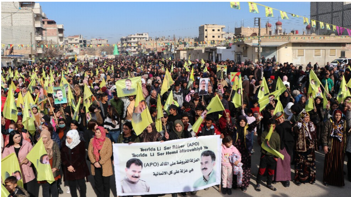
Massive rally for the freedom of Abdullah Öcalan

For the first time in 100 years, the Kurds succeeded in preventing the death penalty given by Turkey through their resistance in 1999. This in turn has to do with the resistance of Mr. Öcalan and his tireless struggle for the right of self-determination of the Kurdish people. Abdullah Öcalan understood the national, regional and global dimensions in this context and decided to follow a different path to freedom for his people. For the solution to the externally created Kurdish question, he started the modern Kurdish freedom struggle.