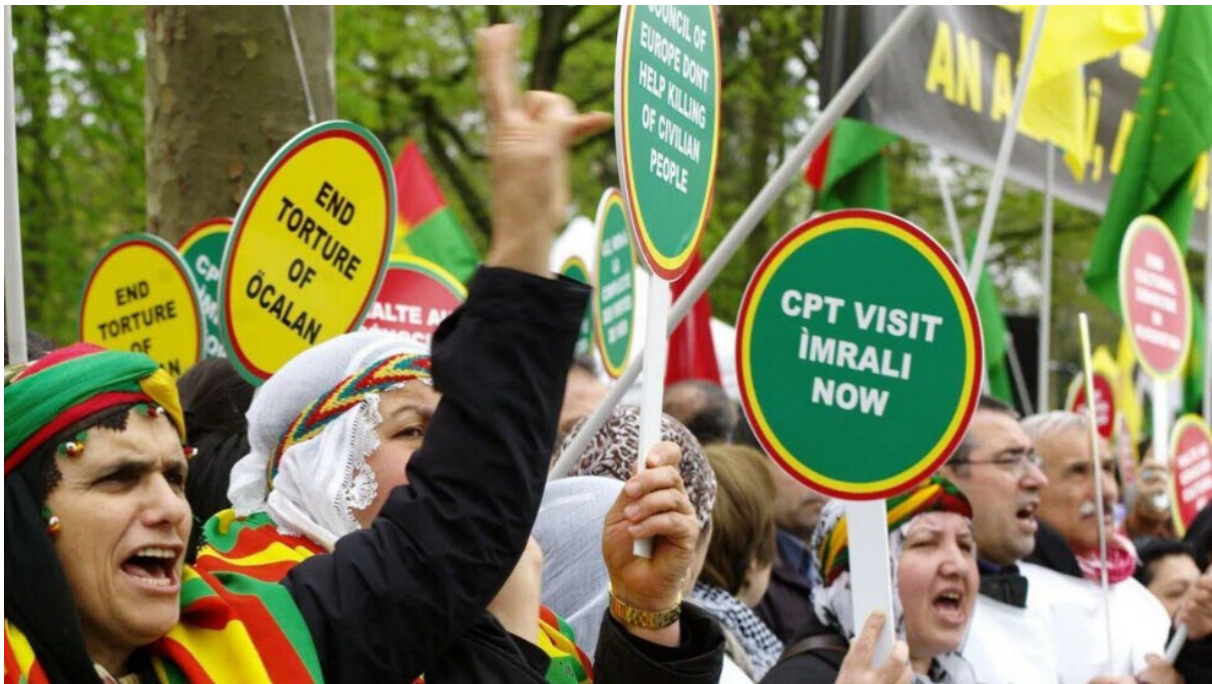
Protest in front of the office of the CPT

In the case of Abdullah Öcalan, the CPT is very important because it can quickly visit him. The CPT is the only institution that can immediately go to the prison island without needing to get permission. Yet, the CPT has not made public any details of its last ad-hoc visit to Imrali Prison between 20-29 September 2022 despite numerous calls from Öcalan's lawyers (the Asrin Law Office) and the Kurdish Freedom Movement, as well as from many other political and legal organizations. Kurds everywhere have been left worried about Öcalan's condition, as they have no access to any information and there have even been suggestions that he never met the CPT delegation – suggestions that the CPT refuses either to unequivocally confirm or deny. CPT inspections are confidential, but, as the Asrin Law Office, the law firm representing Abdullah Öcalan, pointed out in November: "While we are certainly aware of the conventions and procedures binding the CPT, we also know that this does not prevent the CPT from providing information about the conditions of detention of our clients, from whom we have not heard for 28 months."