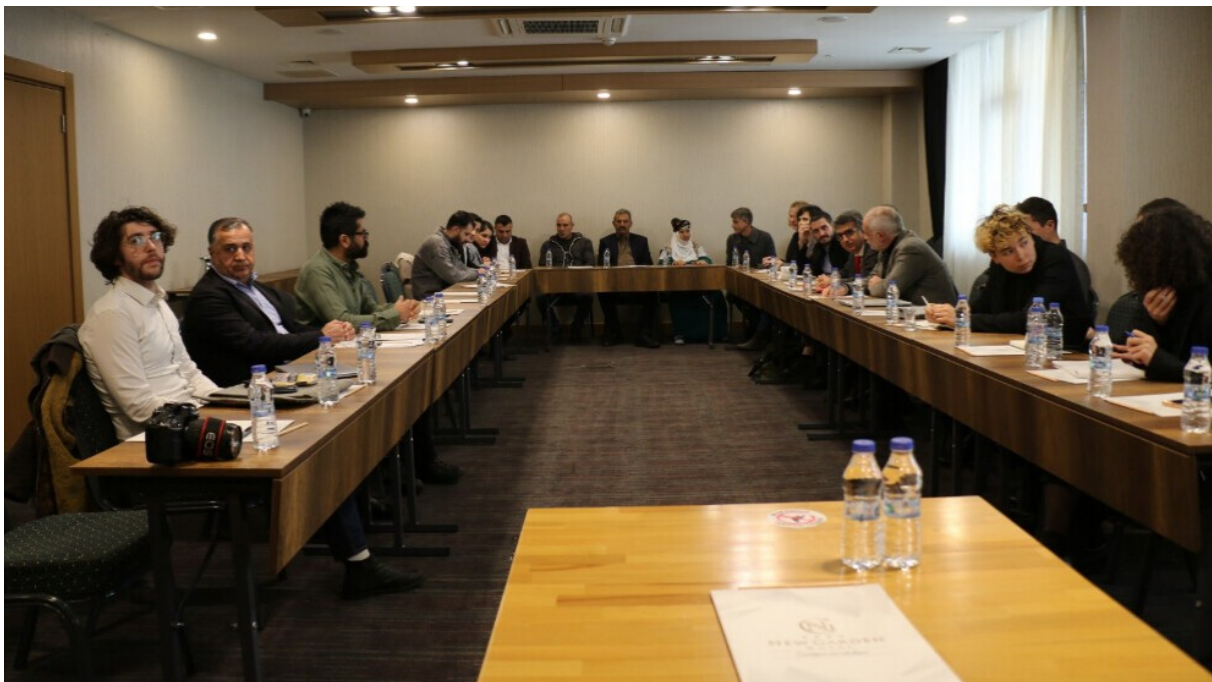
International Lawyers Delegation meeting families of Imrali prisoners