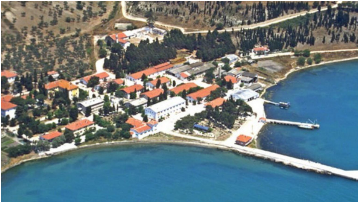
Picture of the Imrali Prison Island

This is also a violation of the rights and privileges of lawyers as set out in the United Nations Basic Principles on the Role of Lawyers, in particular Basic Principles 8 and 16. Basic Principle 8 states clearly: "All arrested, detained or imprisoned persons shall be provided with adequate opportunities, time and facilities to be visited by and to communicate and consult with a lawyer, without delay, interception or censorship and in full confidentiality. Such consultations may be within sight, but not within the hearing, of law enforcement officials." Similarly, Basic Principle 16 states that Governments shall ensure that lawyers are able to perform all of their professional functions without intimidation, hindrance, harassment or improper interference and are able to travel to consult with their clients freely, both within their own country and abroad.