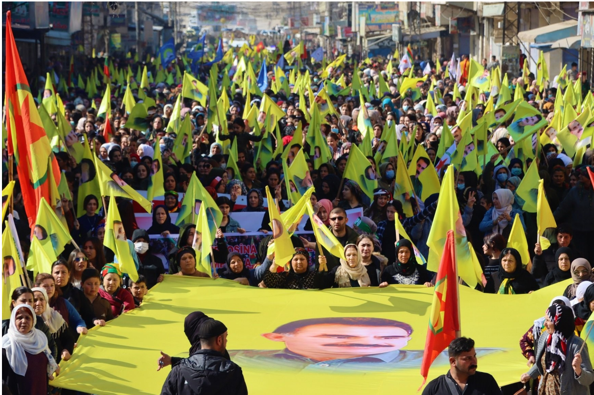
Rally for the freedom of Adullah Öcalan in north Syria

Now aged 74, the Kurdish people's leader Abdullah Öcalan has spent 24 years in prison, almost a third of his life. That is a grave injustice inflicted on him, but Mr. Öcalan's spirit and status remain undiminished. On the contrary, if anything, Mr. Öcalan has grown in significance and his ideas have become even more relevant today. Millions of Kurds across the world regard Abdullah Öcalan as their political leader as they struggle against national, cultural and physical oppression by the Turkish state. He has also brought hope for a better world to people of all backgrounds through political ideas that have demonstrated their potential to transform society.