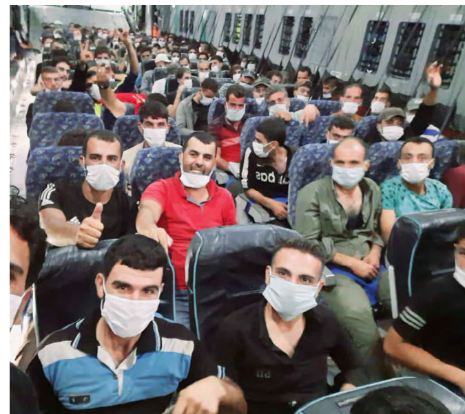
SNA Militants onboard A400

Syrian National Army (SNA) fighters have been transported from Libya, through Turkey to Azerbaijan by means of Turkish Air Force A400M transport aircraft 95 .