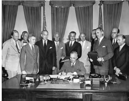
Truman signing NATO treaty